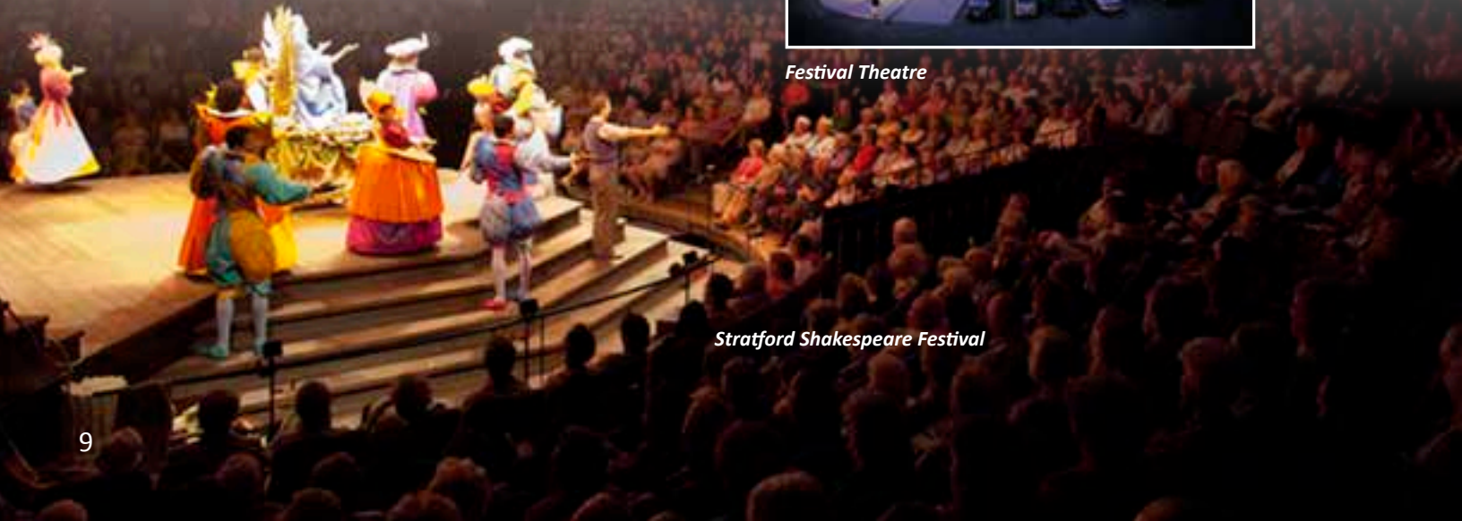
Stratford Shakespeare Festival