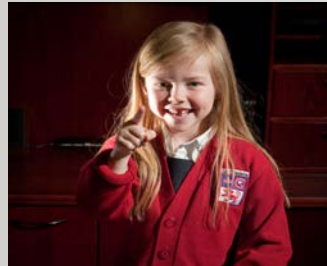
An environment designed for exploration and expression

Providing child-initiated and adult-supported experiences