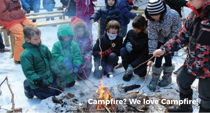
Campfire? We love Campfire!