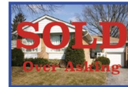
4 Firwood Cres.