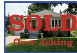
91 Mervyn Ave.