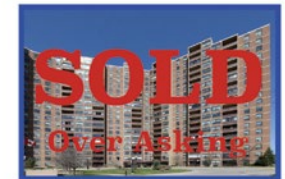
703 - 716 The West Mall