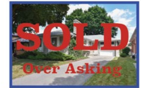
34 Dewitt Rd.