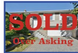
266 La Rose Ave.