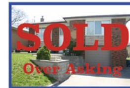
26 Kilburn Pl.