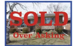
18 Shipley Rd.