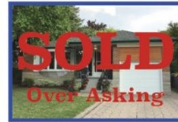
17 Dewitt Rd.