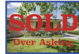
6 Powburn Pl.