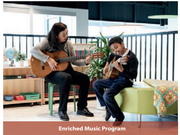
Enriched Music Program