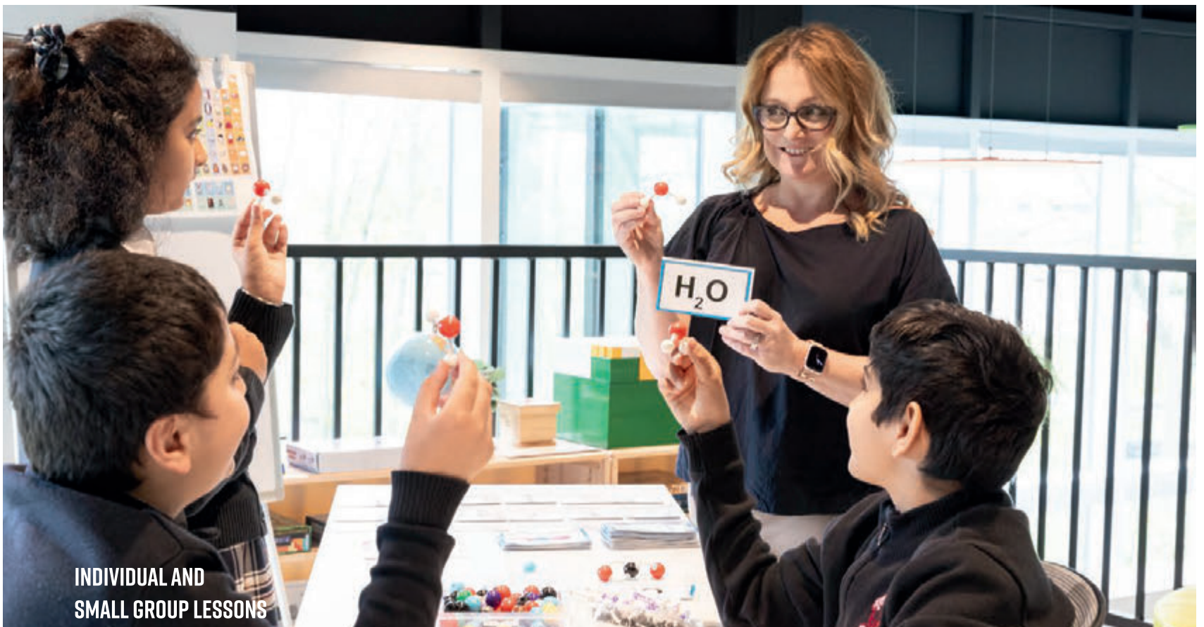
INDIVIDUAL AND SMALL GROUP LESSONS