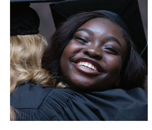
"Let each generation tell its children of your mighty acts; let them proclaim your power."

As each family's situation is unique, we encourage you to contact our Finance Office to determine possible bursaries for which you may qualify.