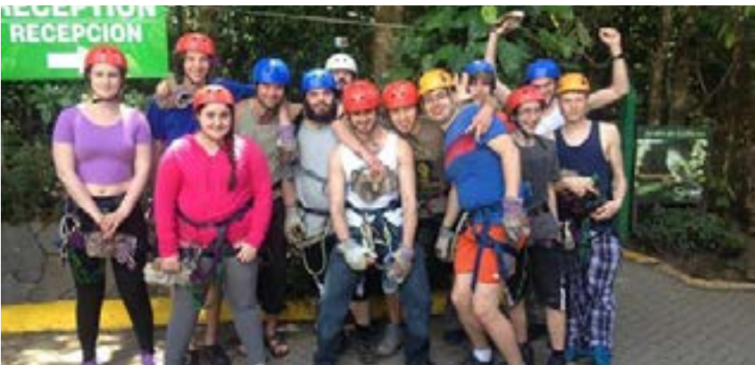
Below: Costa Rica March 2014

“Learning is experience. Everything else is just information.”