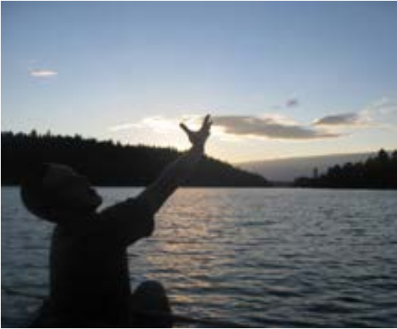
Left: Lake Temagami Summer 2013

Avenue Road Academy offers Travel for Credit programs each year through which students earn one of several appropriately selected elective credits. Past trips have included canoe trips in Southern Ontario and outdoor expeditions in Costa Rica, Thailand and Cambodia.