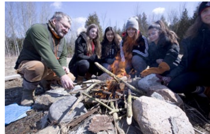
Outdoor education supports a key component of Pickering College's Global Leadership Program as it is experiential in nature and embraces the school's values.