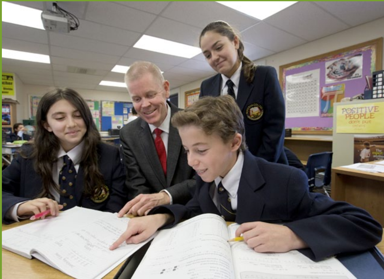
The academic growth and personal development experienced during these important years significantly impacts their futures. The stage for success at the secondary and post-secondary level is set in the Middle School grades.

The Middle School's unique Global Leadership Program – The Pillar Years – is tailored specifically to meet the needs of students ages 10-14. Each student's personalized program explores two central questions: