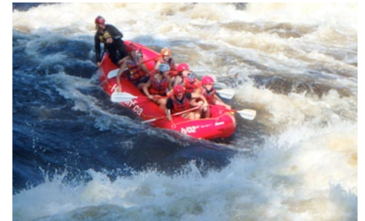
Students are offered a wide range of opportunities that align with the program's 10 demonstrations of global leadership where they learn to experience, lead and act.