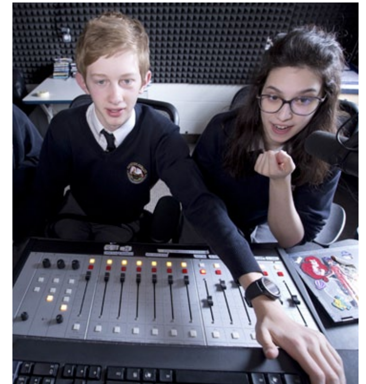
102.7 CHOP FM is a CRTC-licensed, student-operated radio station serving Pickering College and the wider Newmarket community. Broadcasting from New House on the Pickering College campus, this fully-functioning radio station provides a range of community-based programming including a live morning show, sports updates and feature programs – all produced by Pickering students.

With a focus on individualized attention, each Senior School student is assigned a faculty advisor, creating a four-year mentoring relationship that inspires students well after they graduate. The Advisor Program at Pickering College directly contributes to the school's mission to be a leader in education, inspiring individuals to become enlightened citizens who meet high standards, for lifelong growth and learning.