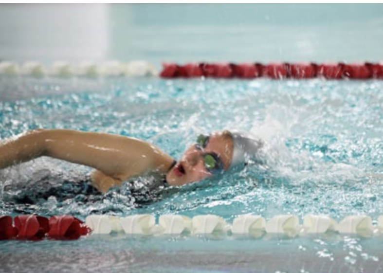
Pickering College offers a wide variety of co-curricular options, including athletics, music, drama and visual arts.